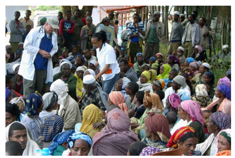
Figure 3: The physician and nurse-translator going into a section of the crowd to select patients.

The International Electronic Journal of Rural and Remote Health Research, Education Practice and Policy