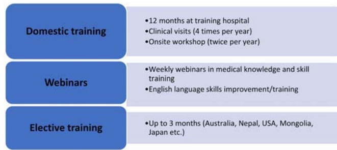
Figure 1: Overview of the Rural Generalist Program Japan.