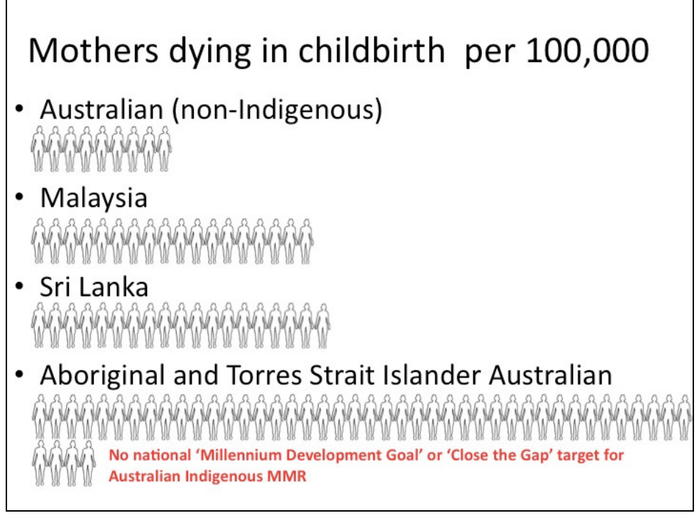
Figure 2: Maternal deaths per 100 000.

BMid, Bachelor of Midwifery; D-D, decision to incision/ delivery'; MGP, midwifery group practices; MMR, maternal mortality