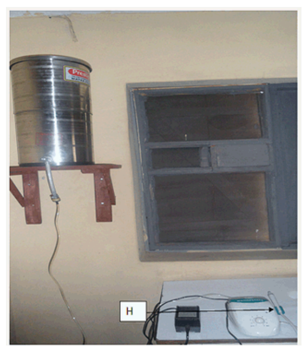
Figure 2: The improvised source of water coolant connected to ultrasonic scaler (H).

Figure 1: The improvised (A) source of water coolant with components: (A1) upper container with internal filter candle, and (A2) lower container connected to (B) tap; (C) rubber gasket; (D) wall-mounted wooden stand; (E) 2 mm transparent hose x 1 m; (F) motion filter and clip connection; (G) 5.5 m transparent hose.