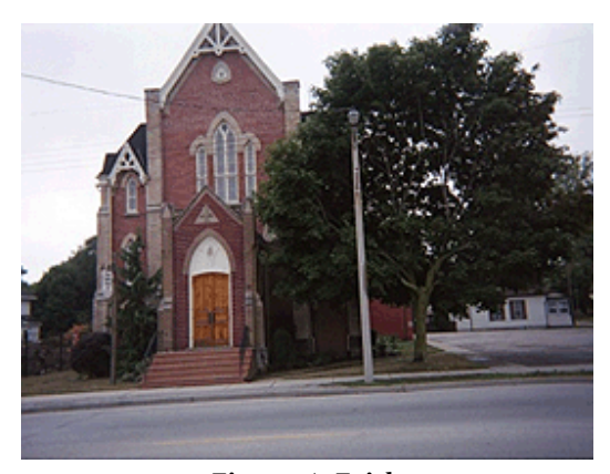
Figure 4: Faith

The International Electronic Journal of Rural and Remote Health Research, Education Practice and Policy