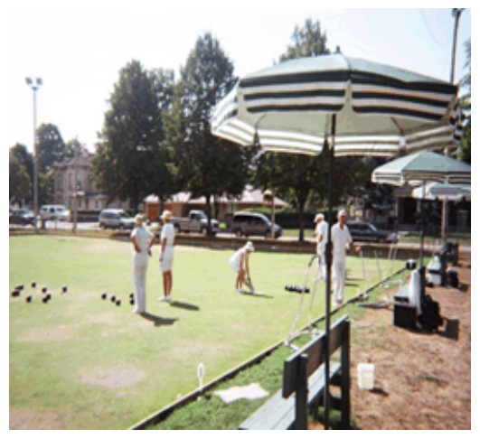
Figure 3: Actively enjoying the summer.

The International Electronic Journal of Rural and Remote Health Research, Education Practice and Policy