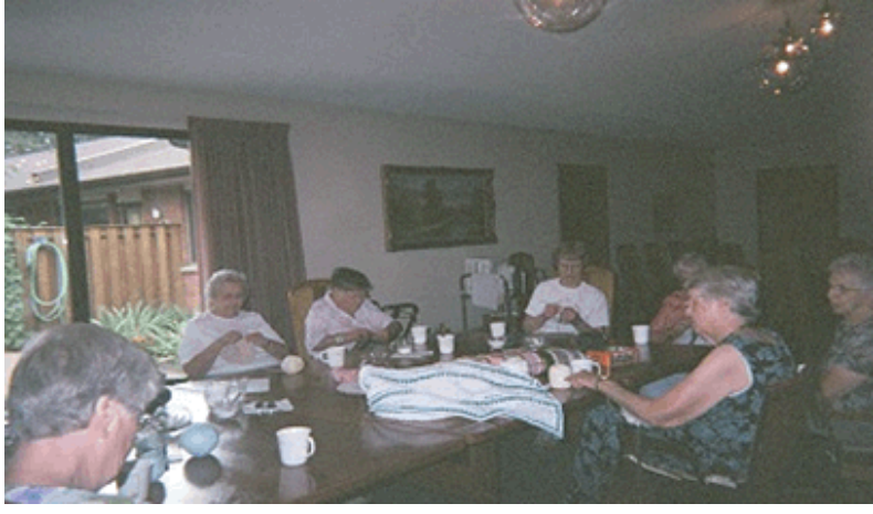
Figure 2: Merry widows

The International Electronic Journal of Rural and Remote Health Research, Education Practice and Policy