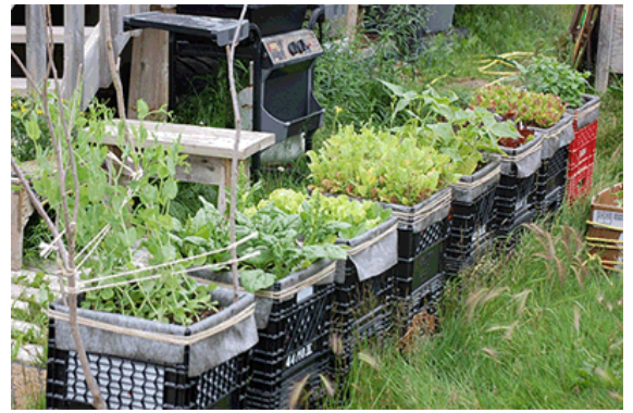
Figure 3: A crate garden, planted and maintained by a local and experienced gardening enthusiast. The owner of this garden was a great resource for gardening knowledge for the local project champions overseeing the greenhouse. (Photo taken 2 August 2011.)

The International Electronic Journal of Rural and Remote Health Research, Education Practice and Policy