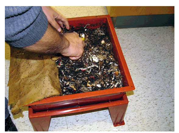
Figure 4: A worm compost maintained by the high school science teacher. Compost was collected in classrooms and the cafeteria and fed to the worms. The worm compost was used as a teaching tool for the high school students. (Photo taken 30 September 2011.)