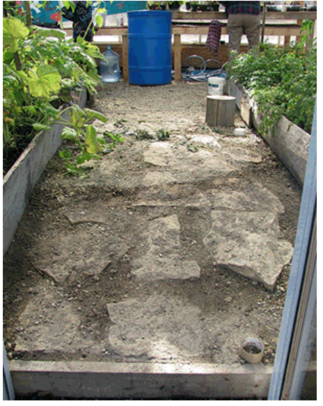
Figure 6: View at the entrance of the greenhouse. Stones from nearby were used to make a sturdy and appealing path through the center of the greenhouse. A tree stump served as a seat to be used while weeding and suckering tomatoes. Tables along the back wall held seedlings, flowers, and pitcher plants that had been retrieved during a student biology excursion. A large blue barrel was used to hold a large quantity of water for watering. (Photo taken 1 October 2011.)

The International Electronic Journal of Rural and Remote Health Research, Education Practice and Policy