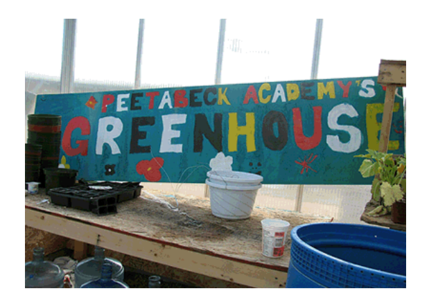
Figure 5: A colourful sign painted by literacy camp members for the greenhouse. The sign was painted in the summer of 2010. Peetabeck Academy is the name of the school situated next to the greenhouse. (Photo taken 1 October 2011.)

Figure 4: A worm compost maintained by the high school science teacher. Compost was collected in classrooms and the cafeteria and fed to the worms. The worm compost was used as a teaching tool for the high school students. (Photo taken 30 September 2011.)