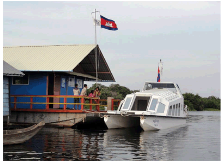
Figure 6: The recently completed TLC-4.