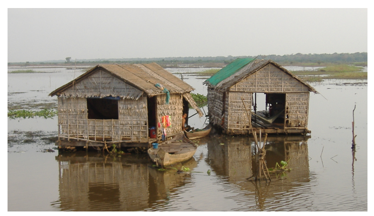
Figure 1: Typical houses within a floating village on Tonle Sap Lake, Cambodia.

The International Electronic Journal of Rural and Remote Health Research, Education Practice and Policy