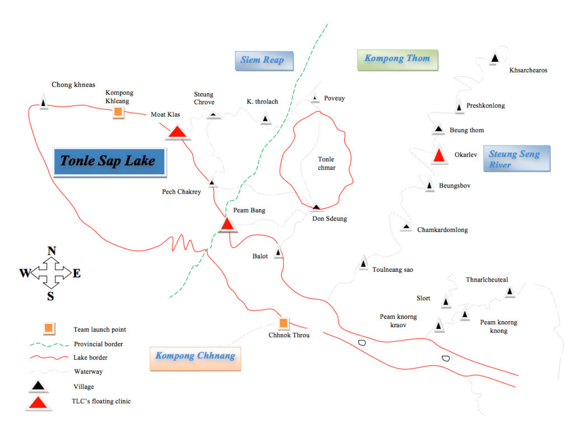
Figure 3: Map of Tonle Sap Lake, Cambodia, showing the 19 villages served, including three villages that have floating clinics (red triangles).

The International Electronic Journal of Rural and Remote Health Research, Education Practice and Policy