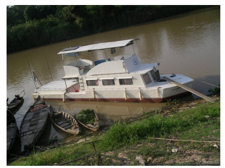
Figure 2: TLC-1 , the boat used to provide health care to people from the remote fishing villages on Tonle Sap Lake, Cambodia

The TLC is staffed by a local physician, one nurse, one midwife, a cook/captain, and at least one or two volunteers to assist with registration and logistics, and one or two volunteer physicians or dentists. The physicians and nurses have basic equipment such as thermometers, stethoscopes, otoscopes, ophthalmoscopes, \rm O_2 saturation probes, and urine dipsticks. There is a wide range of medication from antibiotics, to multivitamins and chronic hypertension medications. The medications are re-stocked each week.