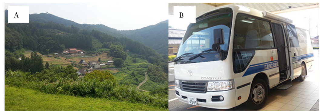
Figure 1: (A) A typical non-physician community in Japan and (B) a mobile clinic service at a non-physician community in Jinseki-Kougen Town, Hiroshima.

The International Electronic Journal of Rural and Remote Health Research, Education Practice and Policy