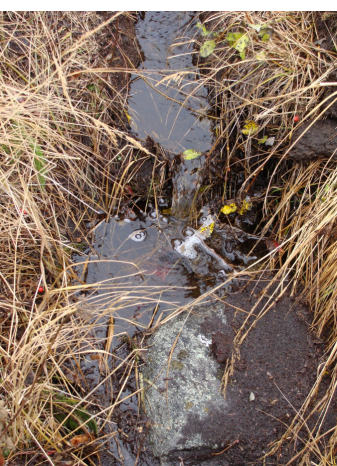
Figure 3: A bog, one of the major sources of drinking water. The brownish color of the water is due to the presence of organic matter. The water often gets contaminated by animal feces.

Figure 2: Retrieving water from a 'well' in Black Tickle. The 'well' is essentially a shallow collection pit, dug in a stream that brings water from an adjacent hill.