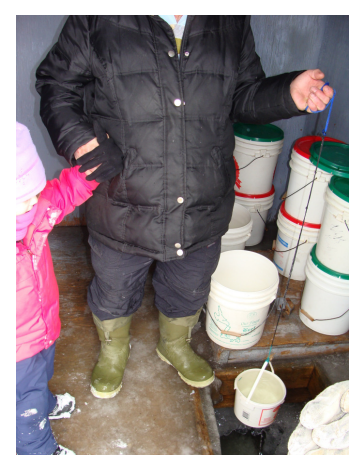
Figure 2: Retrieving water from a 'well' in Black Tickle. The 'well' is essentially a shallow collection pit, dug in a stream that brings water from an adjacent hill.