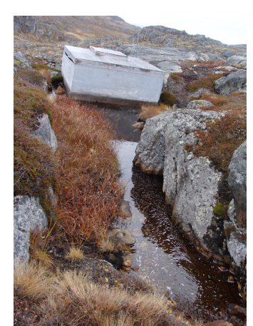
Figure 4: Bog water before reaching the well. In winter, the well gets covered with thick snow, enabling water collection only during the summer.

Figure 3: A bog, one of the major sources of drinking water. The brownish color of the water is due to the presence of organic matter. The water often gets contaminated by animal feces.