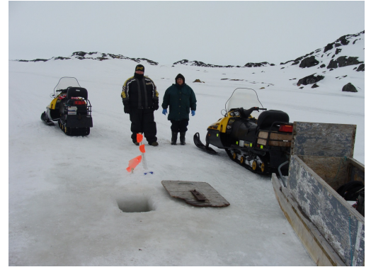
Figure 5: Herring Cove Pond, another source of drinking water. The piece of wood is used to cover the hole.

The International Electronic Journal of Rural and Remote Health Research, Education Practice and Policy