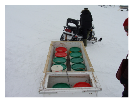
Figure 6: A total of 14 buckets of water for daily use for a family of three or four members.

Figure 5: Herring Cove Pond, another source of drinking water. The piece of wood is used to cover the hole.