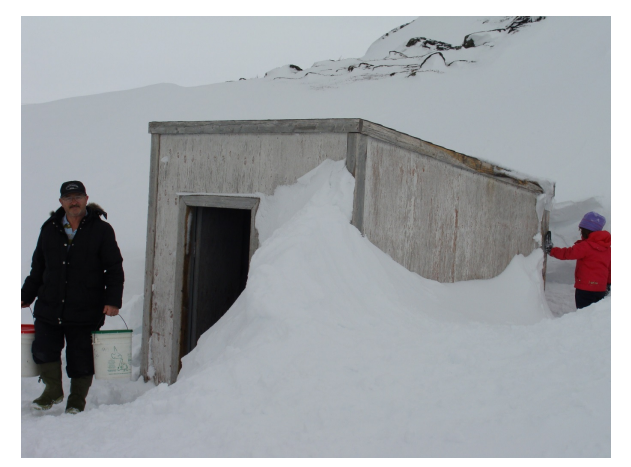
Figure 7: Carrying water is men's work. The majority of men in the community suffer from chronic muscularskeletal injuries with no respite.

The International Electronic Journal of Rural and Remote Health Research, Education Practice and Policy