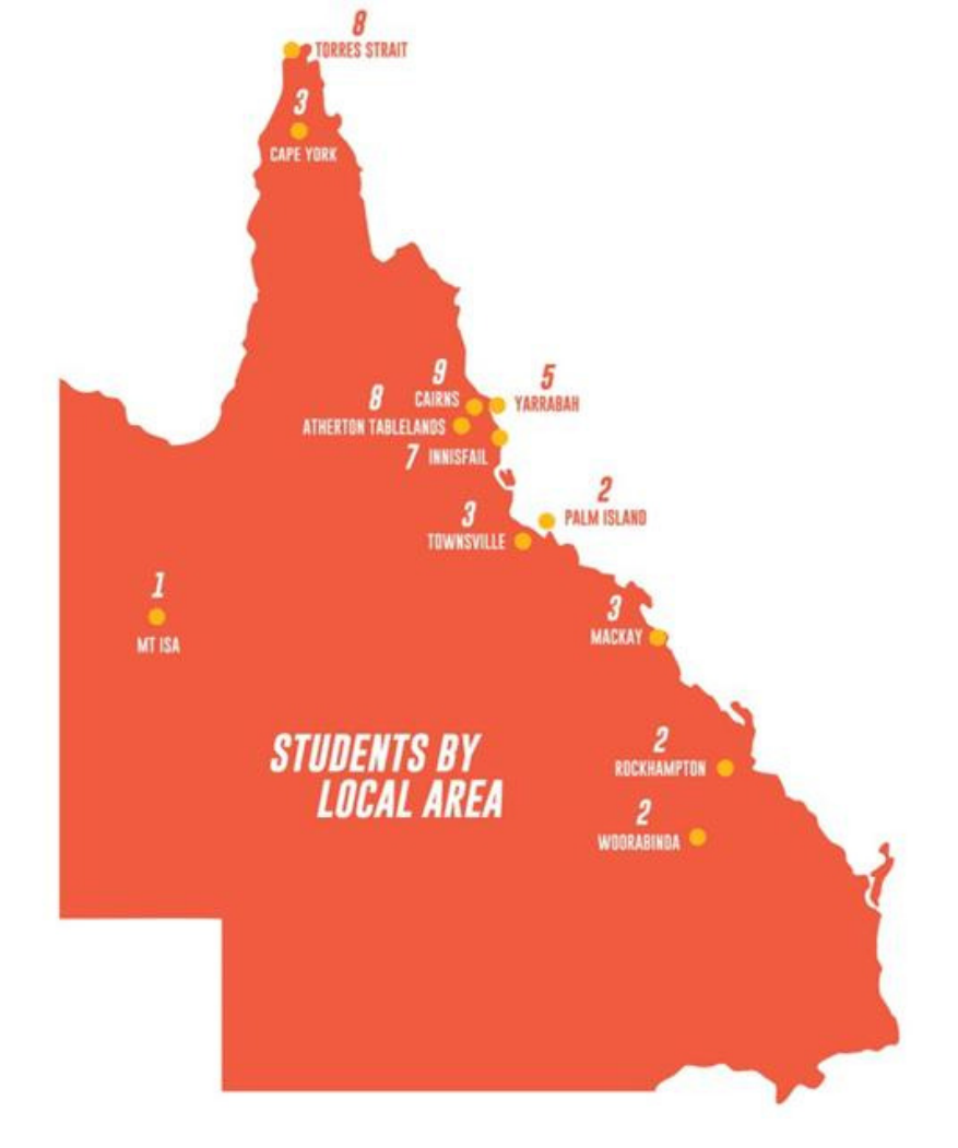
Figure 1: Distribution of students by community.