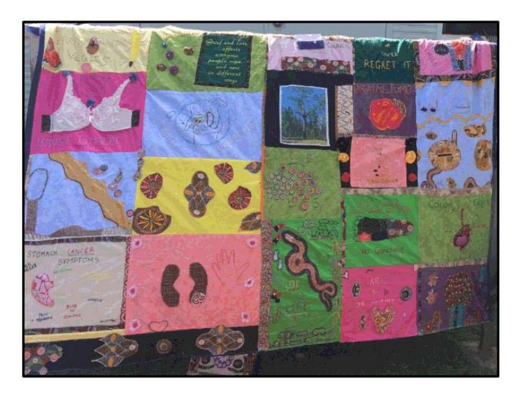
Figure 2: The community quilt, with each square representing community cancer perceptions.

The second resource chosen was a community calendar. A number of photos representing cancer in the community were taken for use in developing a community calendar and messages about cancer awareness, screening and prevention for each month chosen. While several images have been contributed and progress has been made, completion of this resource was not possible in the project timeframe. It is hoped that the images and messages will extend the reach of cancer awareness activities to the broader community as well as contribute to reducing fear and stigma about cancer.