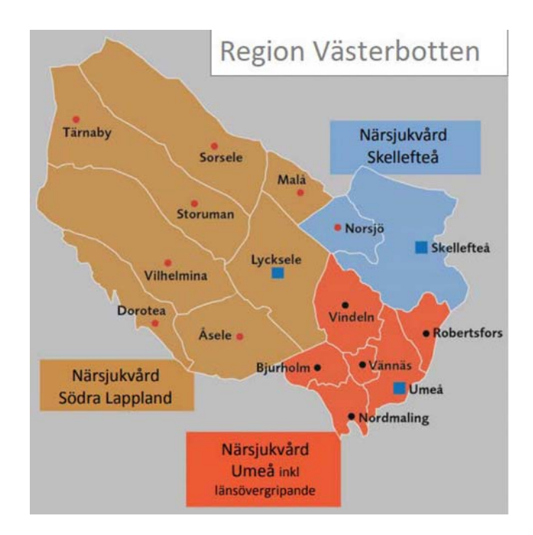
Figure 2: Map of the municipalities in Västerbotten divided into healthcare regions. Cottage hospitals are located in Tärnaby, Sorsele, Storuman, Malå, Vilhelmina, Dorotea and Åsele. Hospitals are located in Lycksele, Skellefteå and Umeå.