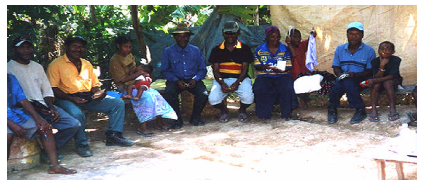
Figure 2: Erima Empowerment Research Project group at a Port Moresby workshop.

The International Electronic Journal of Rural and Remote Health Research, Education Practice and Policy