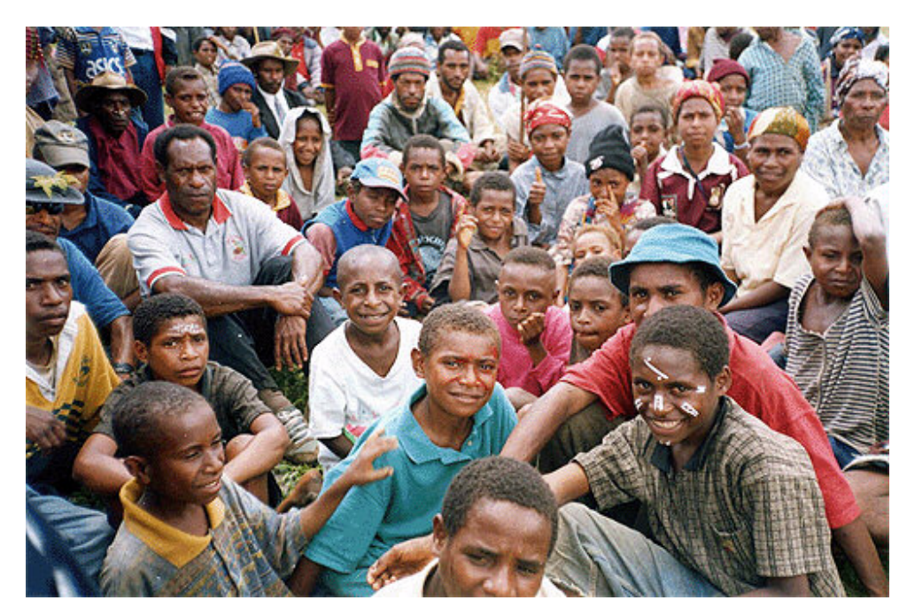
Figure 3: Batri people gathered at the airstrip to receive the bed nets.

The International Electronic Journal of Rural and Remote Health Research, Education Practice and Policy