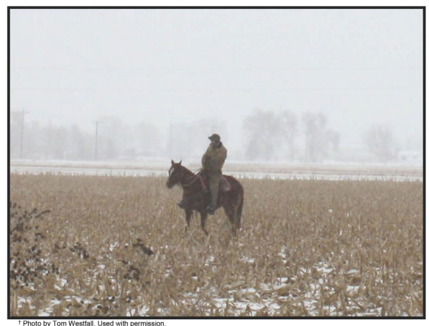
Figure 1: Rider on the Platte River.†